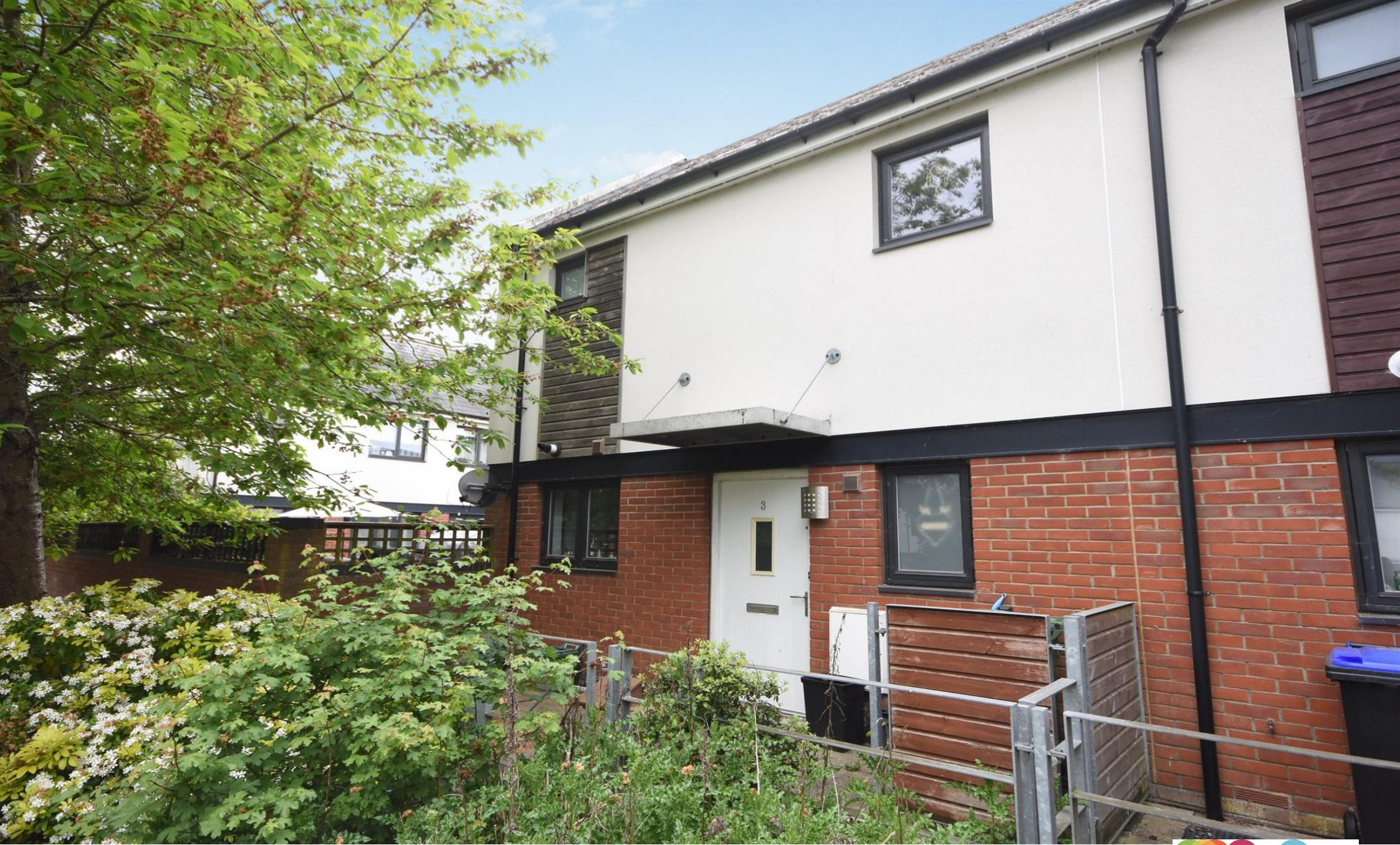
Oak Tree Gardens, Braintree, CM7 5FH