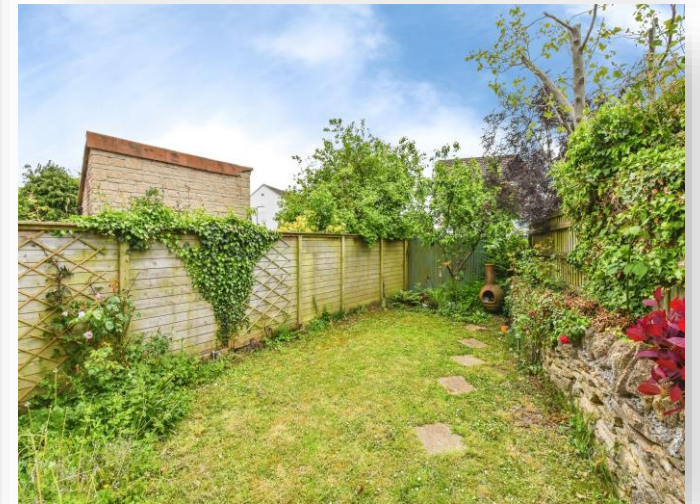
Courts Barton, Frome, BA11 4QB