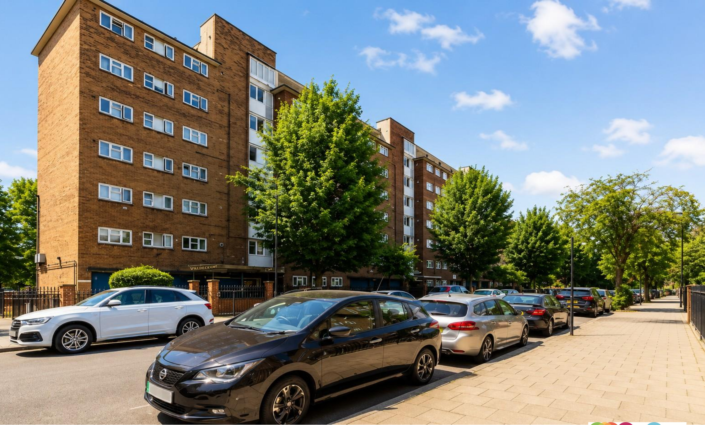
Jephson Court Studley Road, London SW4 6SB