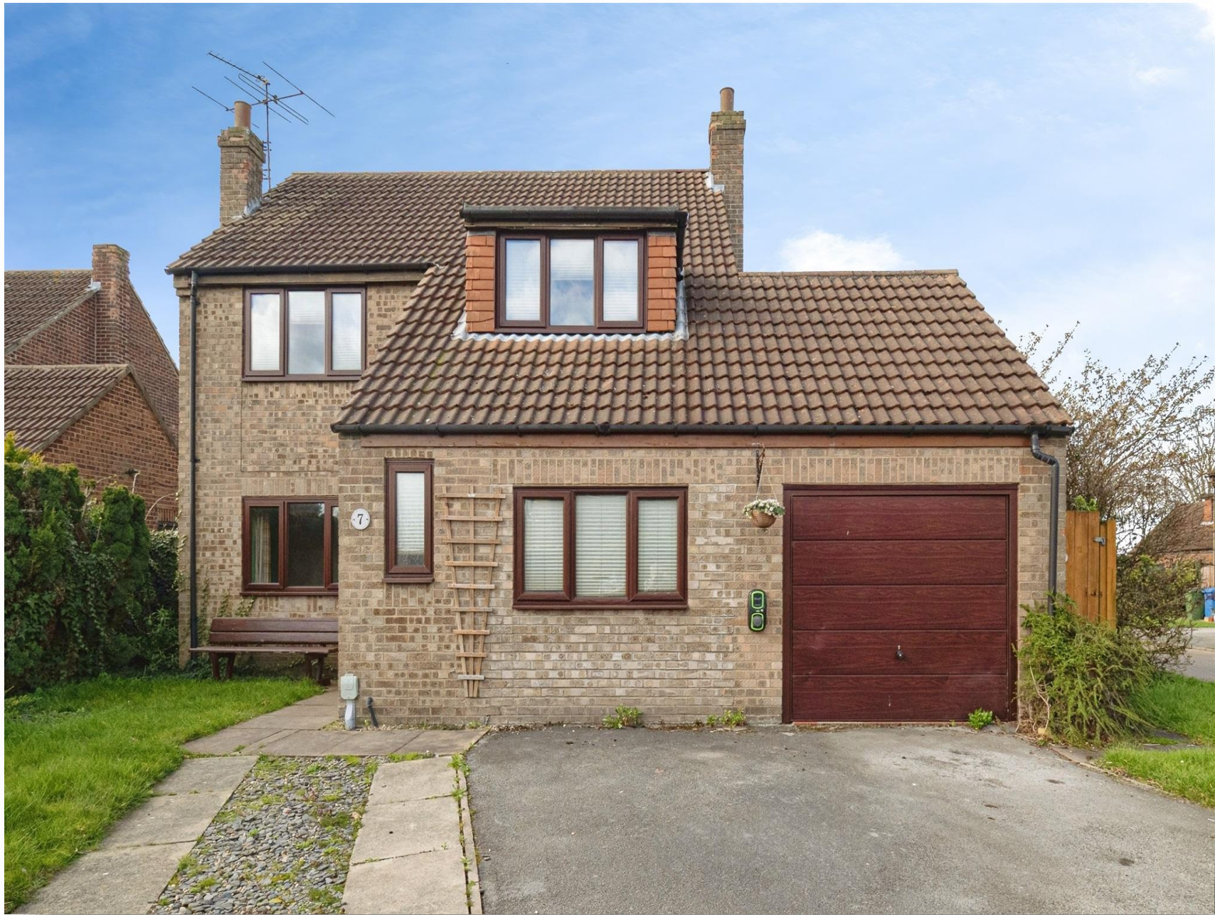
Scotts Garth Close, Tickton, Beverley, HU17 9RQ