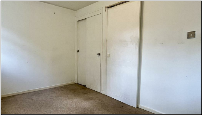
Newhall Farm Close, Sutton Coldfield, B76 1BQ