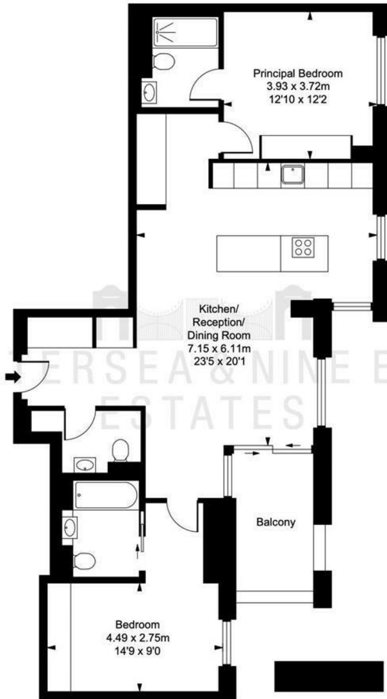
ILLUSTRATION FOR IDENTIFICATION PURPOSES ONLY ALL MEASUREMENTS AND AREA FIGURES SUPPLIED BY OTHERS, ACCURACY IS NOT GUARANTEED. THIS PLAN MUST NOT BE REPRODUCED BY ANY OTHER PERSON WITHOUT PERMISSION

These particulars, whilst believed to be accurate are set out as a general outline only for guidance and do not constitute any part of an offer or contract. Intending purchasers should not rely on them as statements of representation of fact, but must satisfy themselves by inspection or otherwise as to their accuracy. No person in this firm's employment has the authority to make or give any representation or warranty in respect of the property.