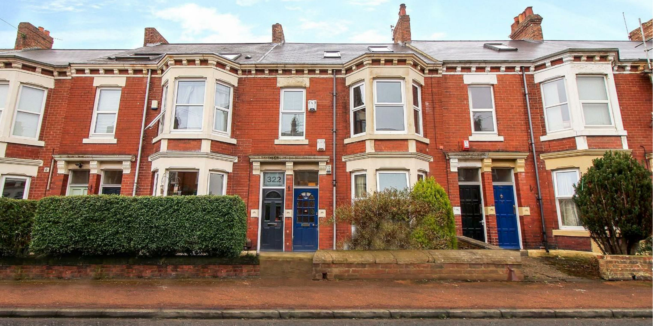
📍 Simonside Terrace, Newcastle Upon Tyne NE6 5DS