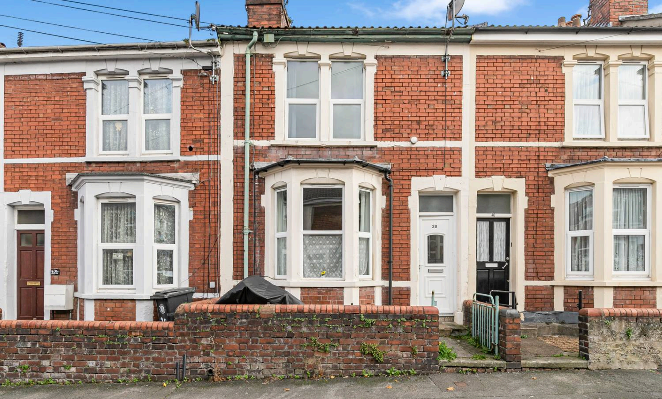
38 Carlton Park, Bristol £319,950