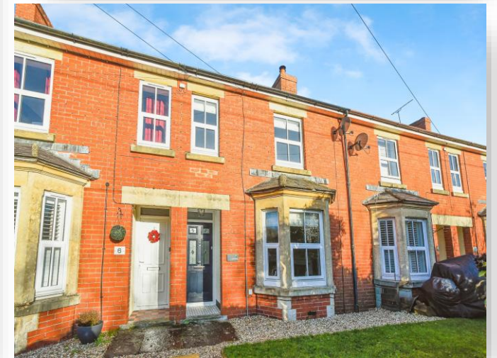
Turnpike Road, Blunsdon Swindon SN26 7EA