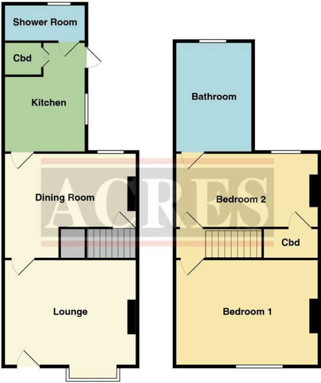
THIS PLAN IS NOT TO SCALE AND IS GIVEN TO PROVIDE A GENERAL GUIDE. IT MERELY INDICATES APPROXIMATE RELATIONSHIP OF ONE ROOM TO ANOTHER.