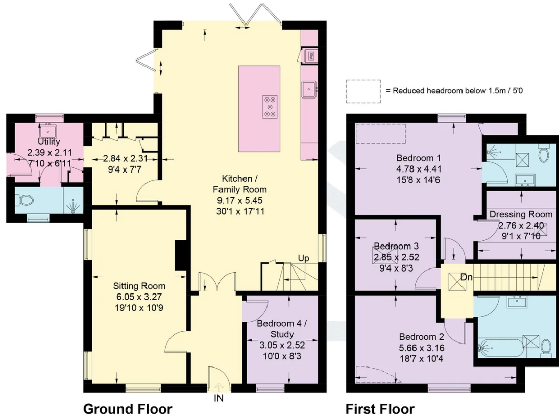
Illustration for identification purposes only, measurements are approximate, not to scale. Fourlabs.co © (ID1282825)

Approximate Gross Internal Area = 161.9 sq m / 1743 sq ft