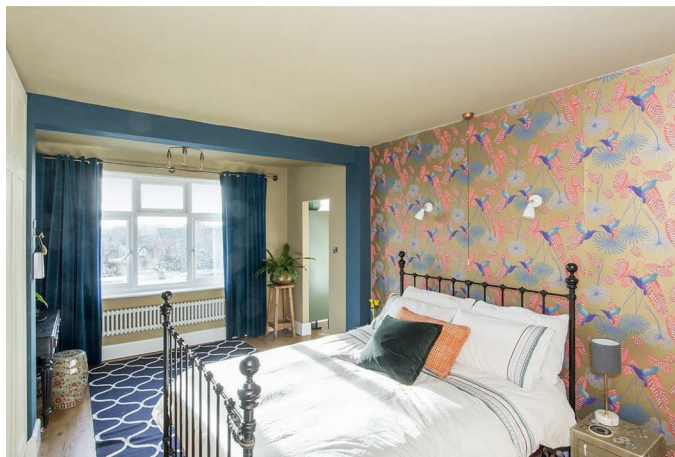
Bedroom One 18'4" x 10'11" (5.59 x 3.33)

18' 4" x 10' 11" (5.59m x 3.33m) Double glazed window with views over the rear garden. Range of fitted wardrobes and storage cupboards. Radiator. Two wall lights. Door to:-