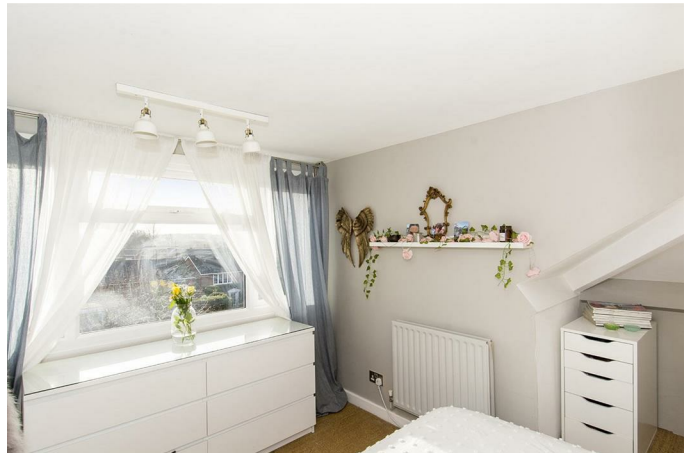
Bedroom Two 11'11" x 8'6" (3.63 x 2.59)

11' 11" x 8' 6" (3.63m x 2.59m) Double glazed window with views to the rear aspect. Radiator. Under eaves storage cupboards.