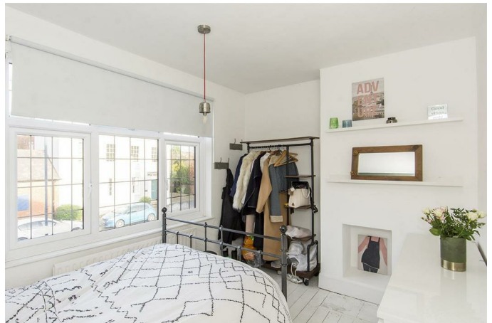
Bedroom Three (Photo Two)

11' 8" x 8' 9" (3.56m x 2.67m) Leaded double glazed window to the front elevation. Radiator.