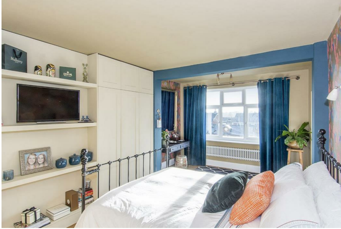
Bedroom One (Photo Two)