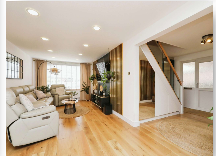
55 Heath Rise, Fakenham, NR21 8HX