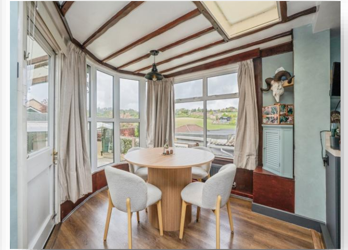
Francis Road, Horndean, Waterlooville PO8 0HZ