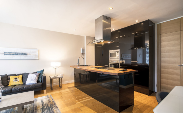
Open Plan Living Space