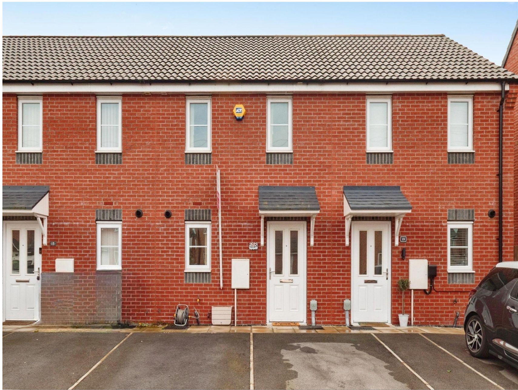
Harbottle Way, Kingswood, Hull, HU7 3NX