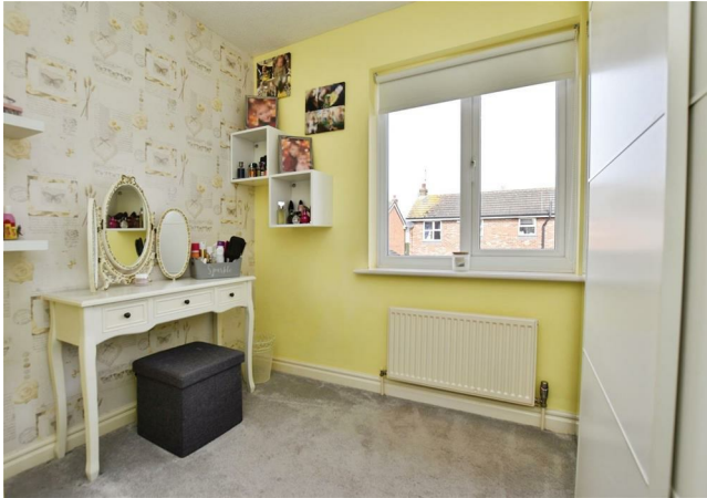
Bedroom Three 10'0" x 8'6" (3.06 x 2.61)

A double bedroom, currently used as the dressing room but would easily return to a bedroom. Double glazed window and radiator.