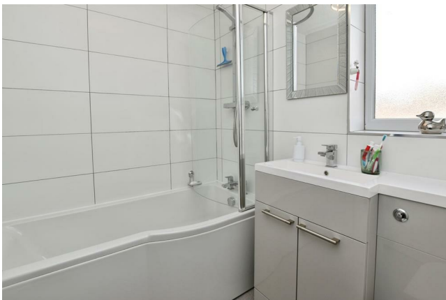
Family Bathroom 7'0" x 5'5" (2.14 x 1.67)

A contemporary family bathroom with panelled bath and over head shower with glazed screen. Vanity unit housing the toilet with concealed cistern and wash basin with useful storage below. Double glazed obscure window and radiator.