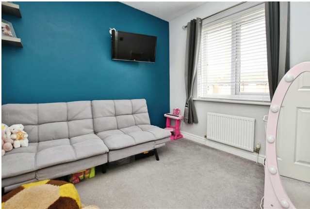
Bedroom Four 8'7" x 7'11" (2.62 x 2.43)

A double bedroom with double glazed window and radiator.