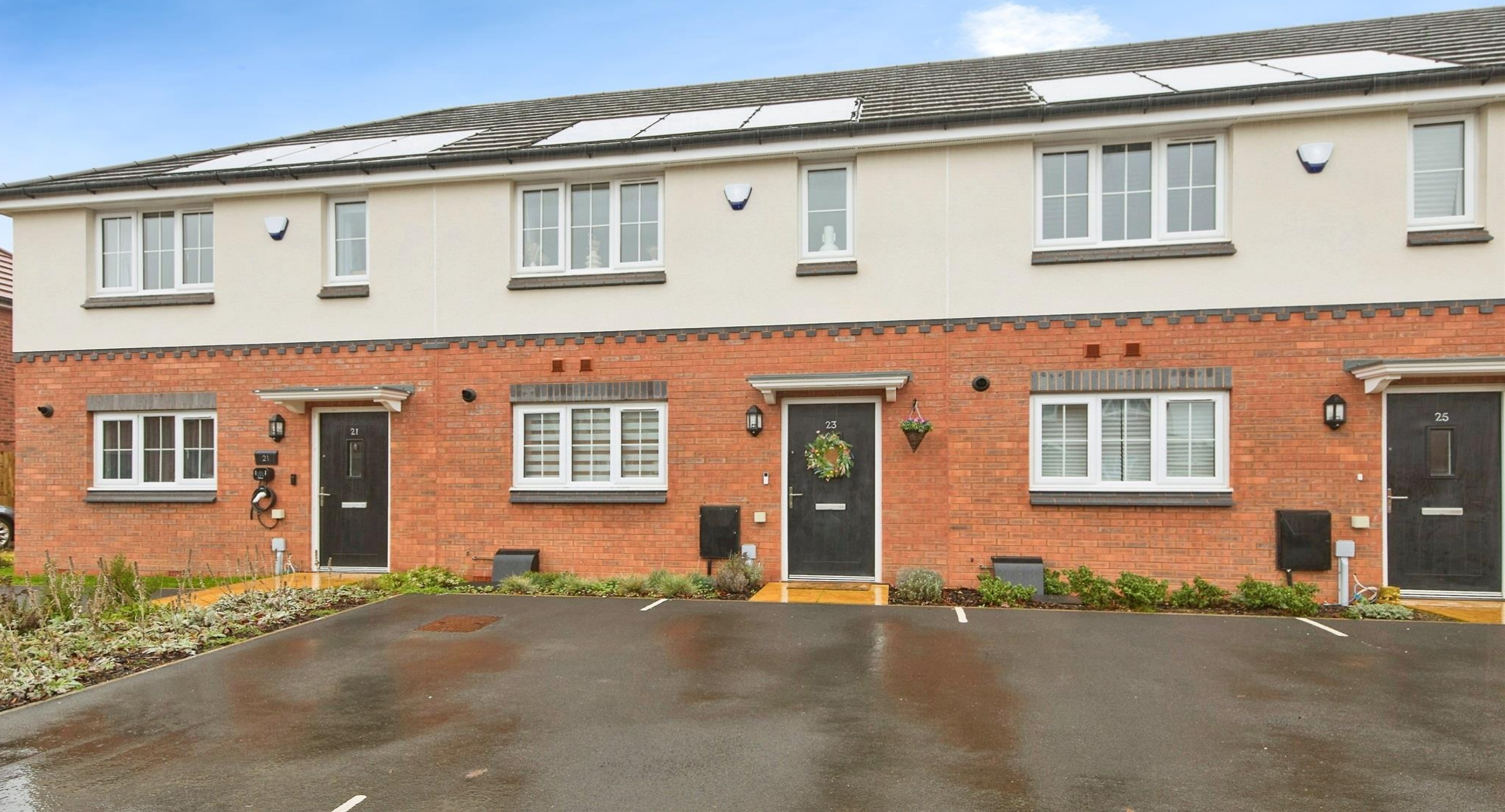
Shirland Close, Drakelow, Burton-On-Trent