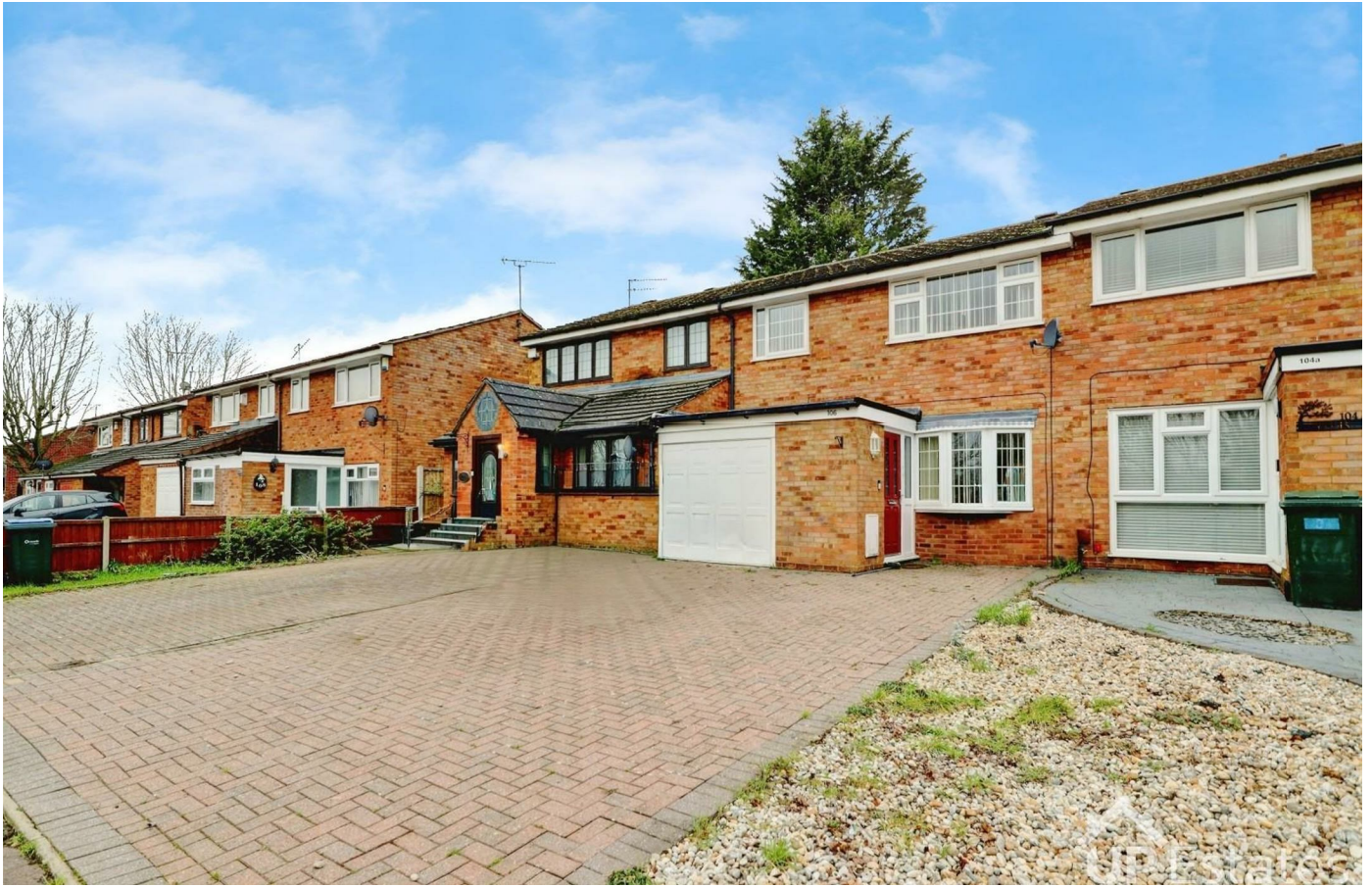
Dorchester Way, Coventry