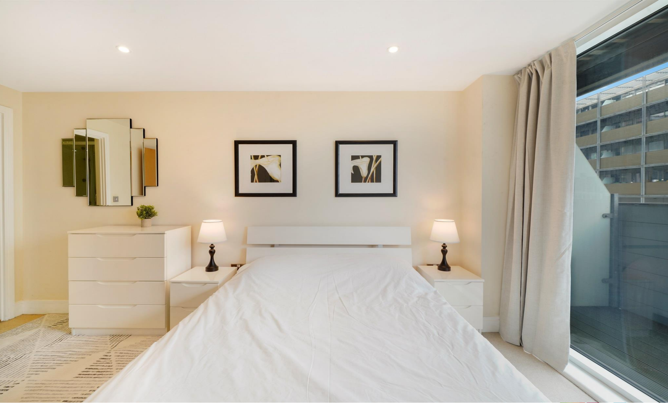
Torrent Lodge Merryweather Place, London SE10 8EQ