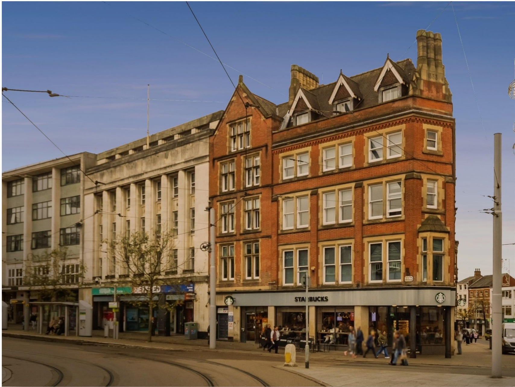
South Parade, NOTTINGHAM NG1 2JS