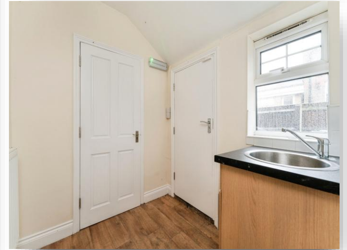
Burrowmoor Road, March PE15 9RP