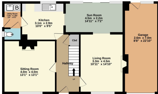
Ground Floor 79.3 sq.m. (854 sq.ft.) approx.