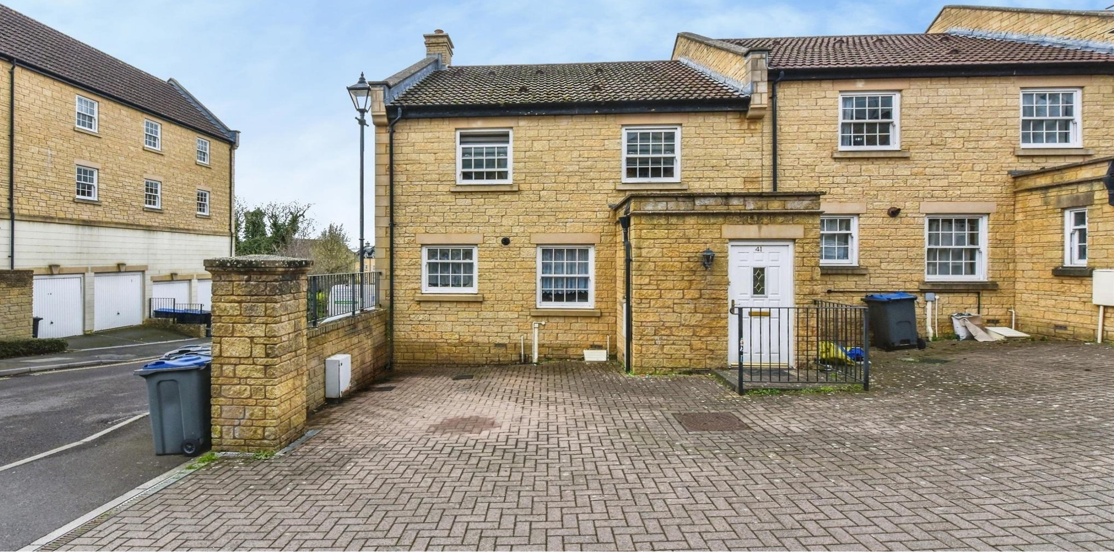
Flowers Yard, Chippenham SN15 3BN