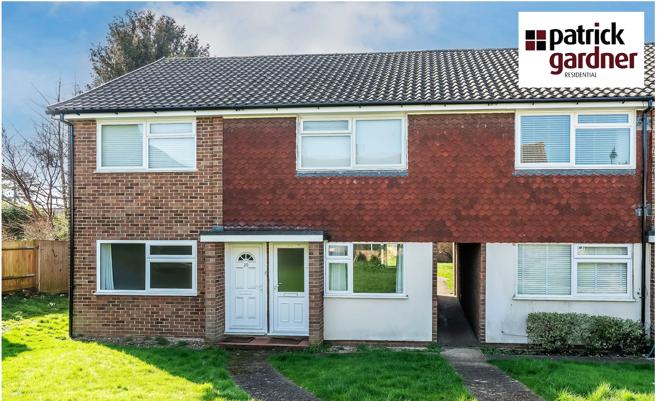
20 Russell Court, Leatherhead, KT22 8AR