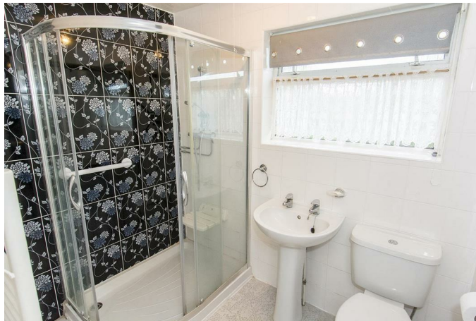
Shower Room 5'5" x 7'7" (1.65m x 2.31m)

The shower room briefly comprises of a low-level W/C, a pedestal hand wash basin, a corner shower cubicle and a heated towel rail. Ceramic wall tiles and vinyl flooring throughout. An opaque window to the rear.