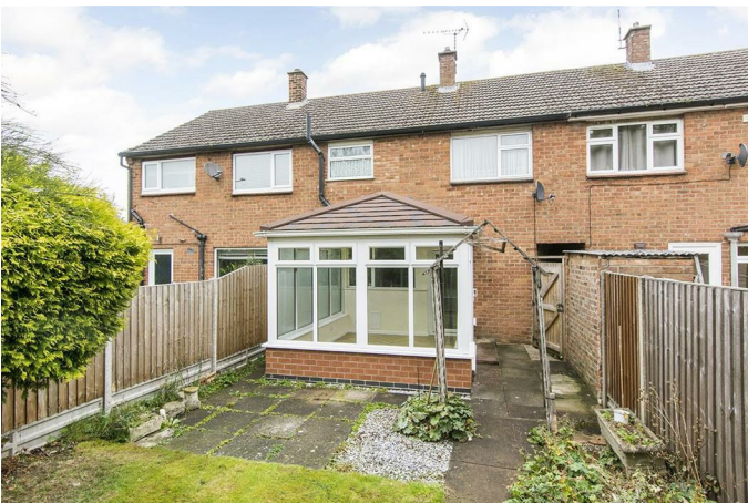
Rear Aspect Photo

To the front you will find a drive which provides a parking space, there is also adequate parking on the street.