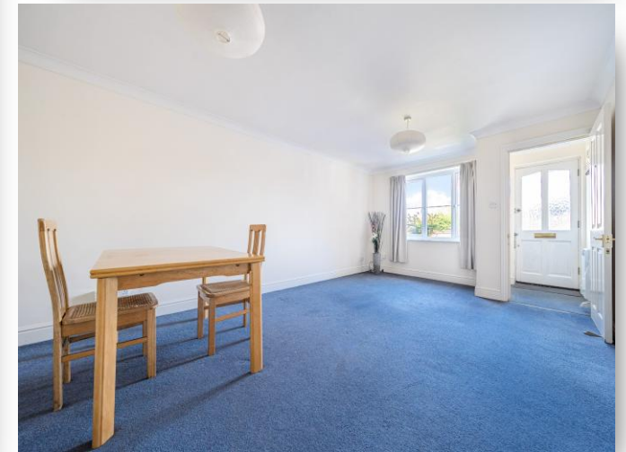
11 Alston Gardens, Maidenhead SL6 6DY