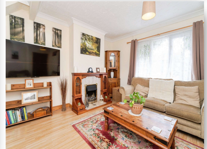
Council House, Pond End, West Rudham, King's Lynn, PE31 8TB