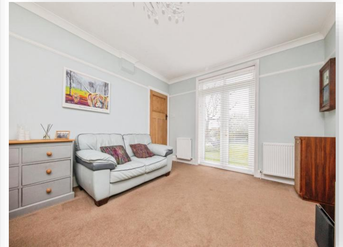
Little Orchard, Grove Hill, Belstead, Ipswich, IP8 3LU