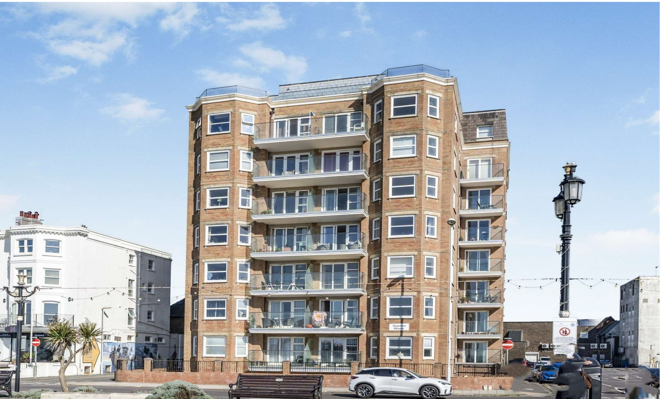
Augusta House Augusta Place, Worthing BN11 3PY