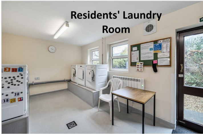
Residents' Laundry Room