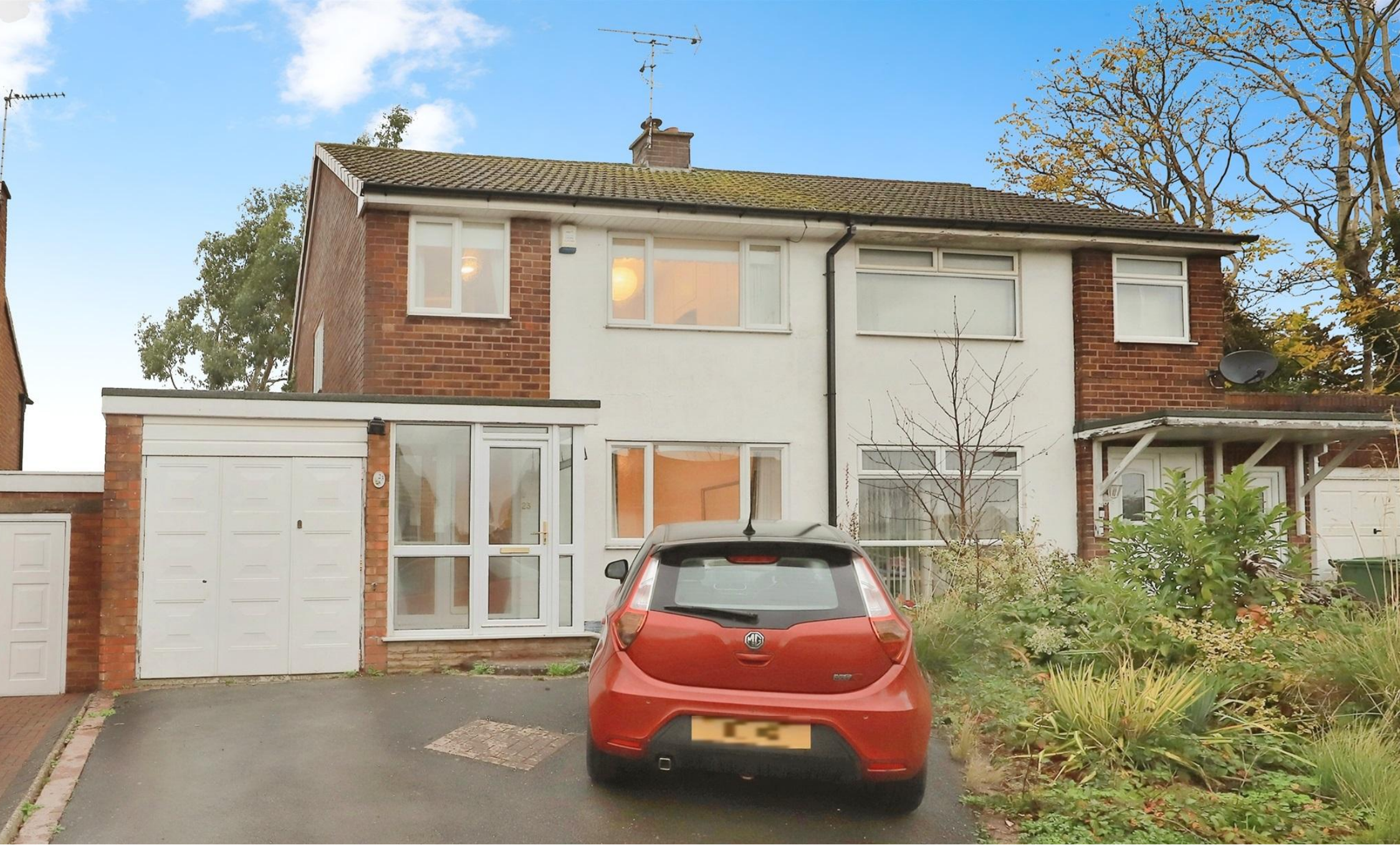
The Greenway, Hagley, STOURBRIDGE, DY9 0LT