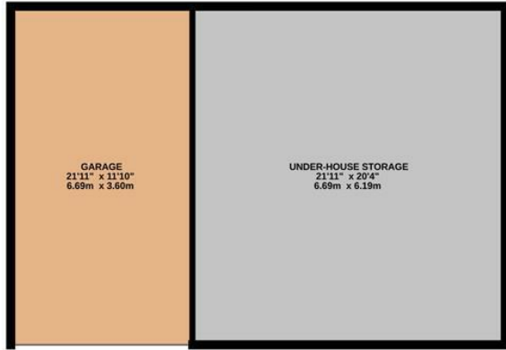
GROUND FLOOR 705 sq.ft. (65.5 sq.m.) approx.