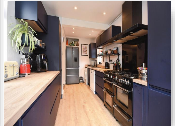
Beridge Road, Halstead, CO9 1JX