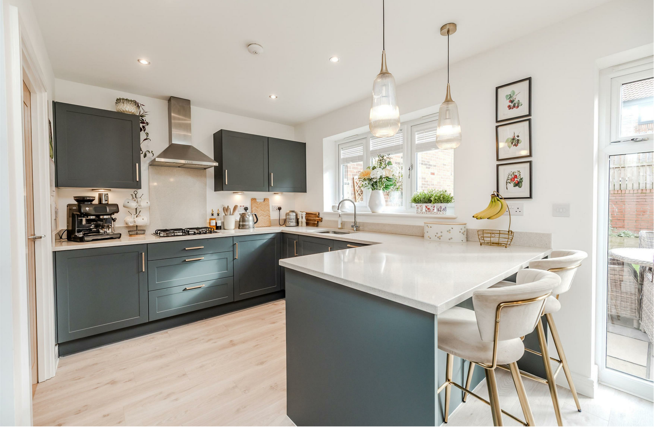
3 Petunia Grove, Callerton, Newcastle upon Tyne, NE51DZ