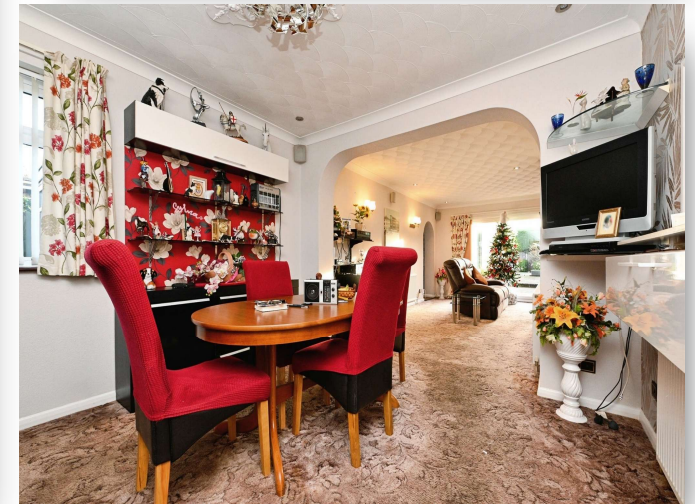
Common Road, Runcton Holme, King's Lynn, PE33 0AA