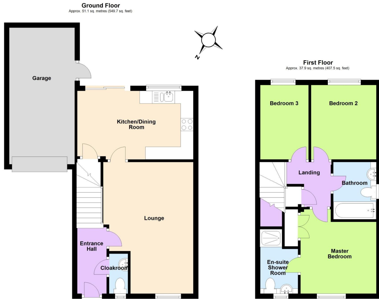
Total area: approx. 88.9 sq. metres (957.2 sq. feet)