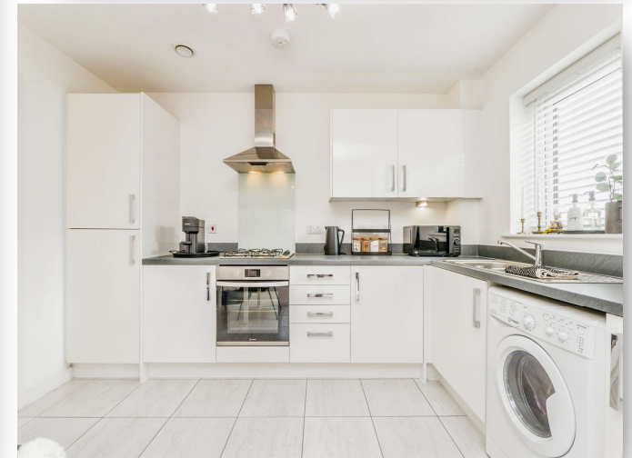
Rhodfa Crughywel, St. Mellons Cardiff CF3 0FH