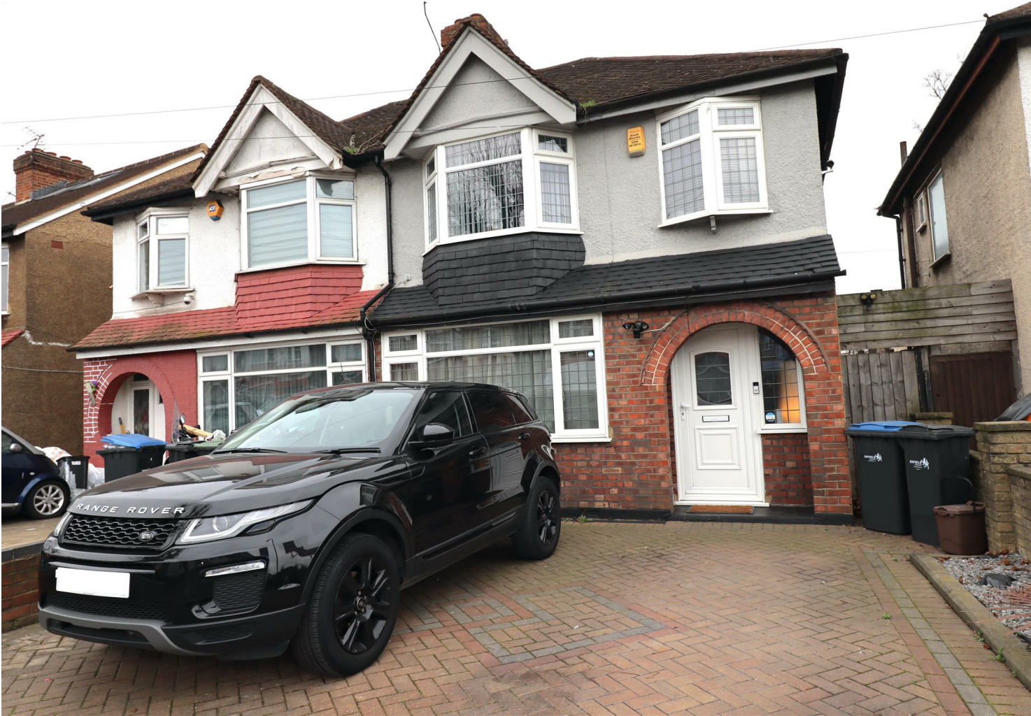
Harrow Drive, London, N9 9EN

This floor plan is for illustrative purposes only. It is not drawn to scale. Any measurements, floor areas (including any total floor area), openings and orientation are approximate. No details are guaranteed, they cannot be relied upon for any purpose and they do not form part of any agreement. No liability is taken for any error, omission or misstatement. A party must rely upon its own inspection(s). Plan produced for Purplebricks. Powered by www.focalagent.com