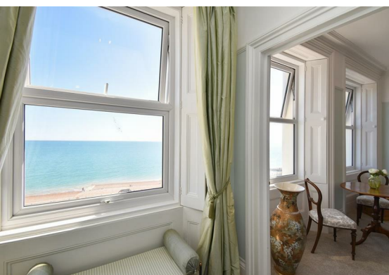
7'8" x 7'2" (2.36m x 2.20m)