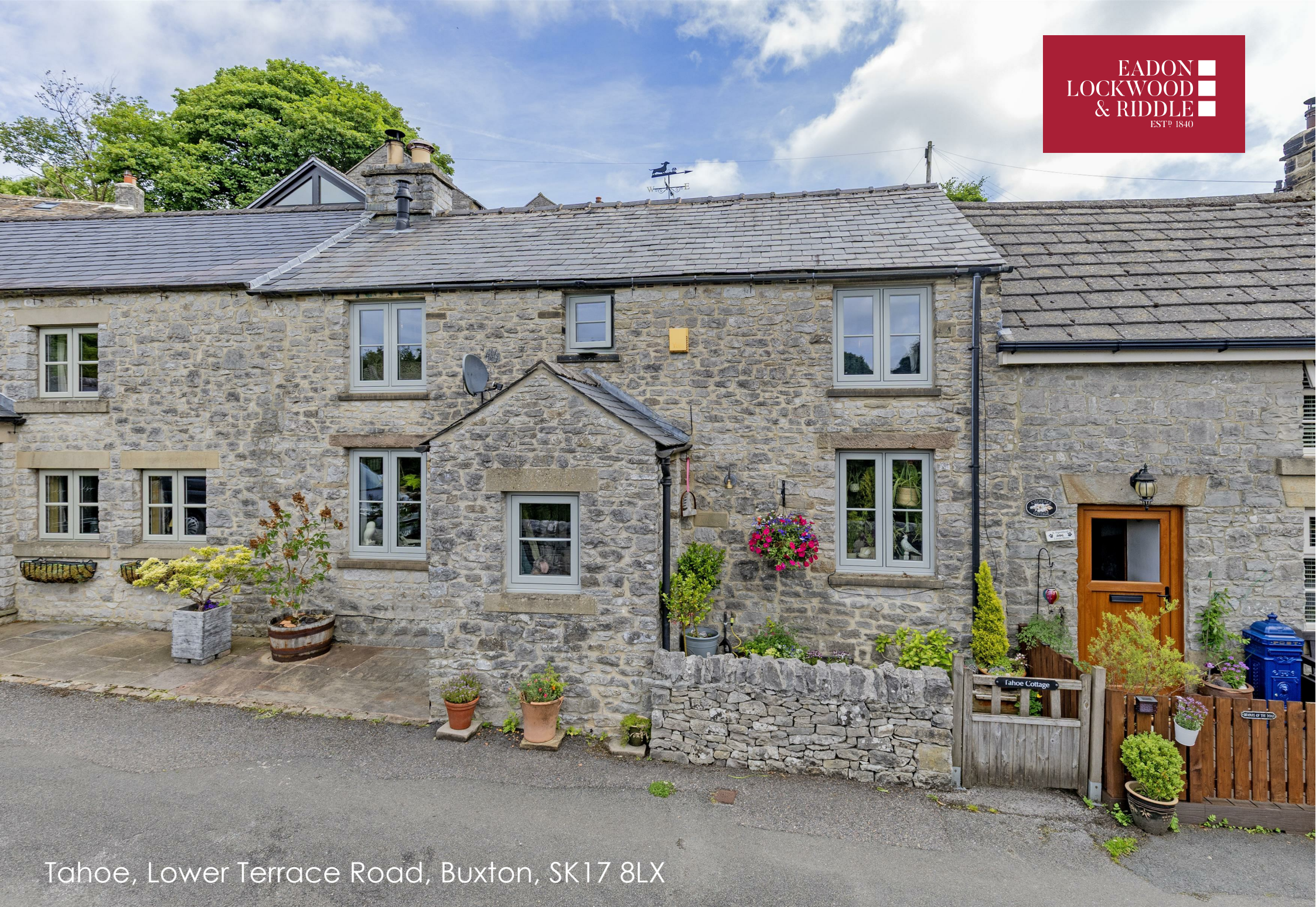
Tahoe, Lower Terrace Road, Buxton, SK17 8LX