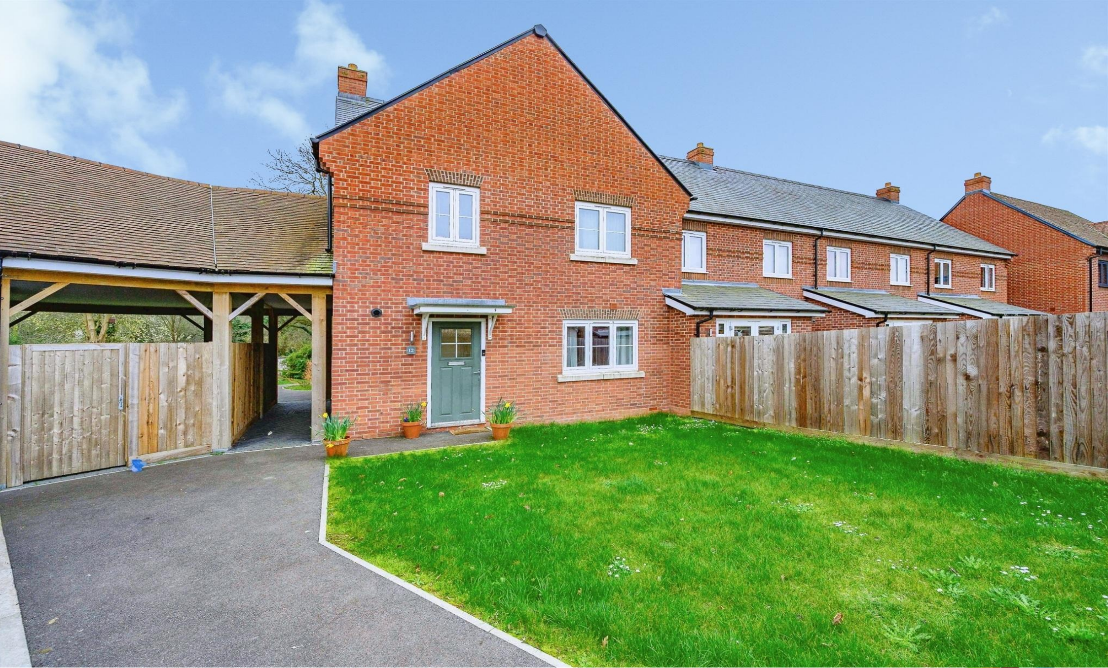
Heron Mews, Bourne End Hemel Hempstead HP1 2EG