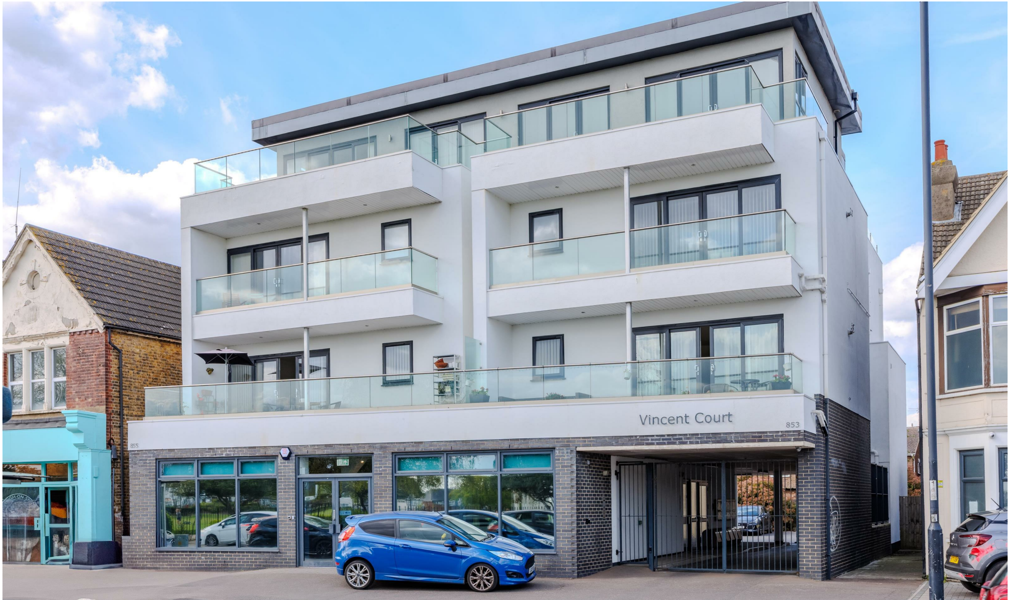
Vincent Court, London Road, Westcliff £1,450 PCM