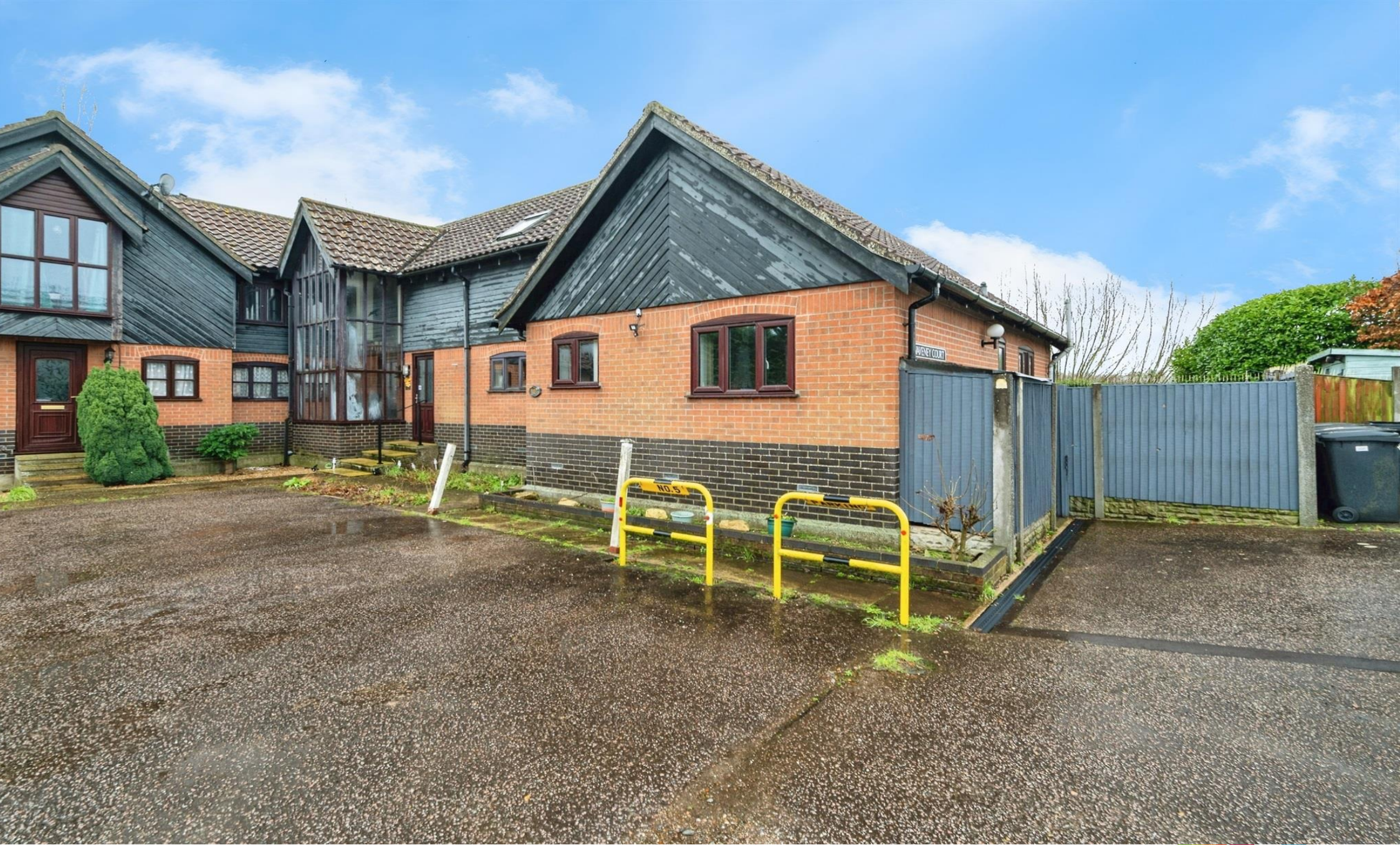
Waveney Court, Diss IP22 4EW