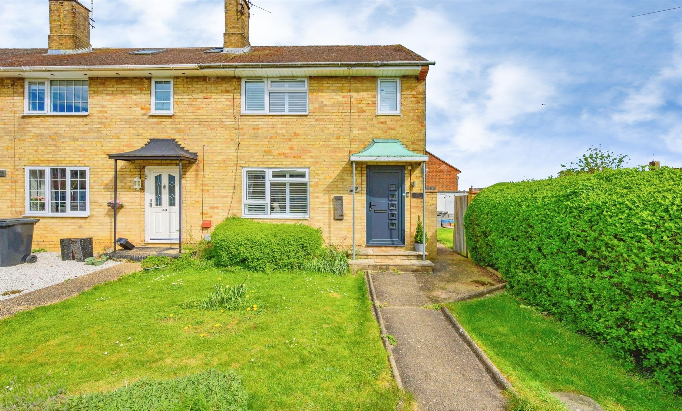
Hawthorn Lane, Hemel Hempstead HP1 2QA