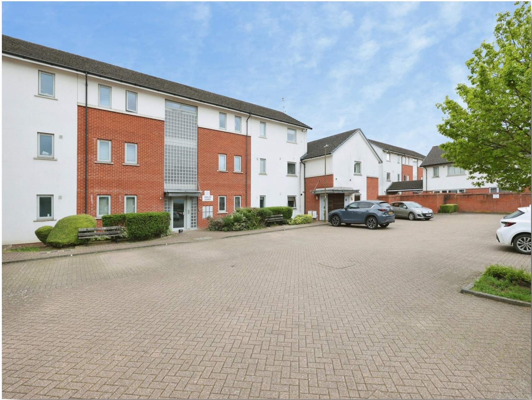
Avalon Court, Hartswood Close, Bushey, WD23 2GF