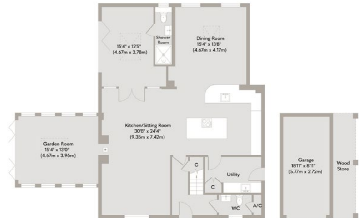
Ground Floor Approximate Floor Area 1389 sq. ft (129.02 sq. m)