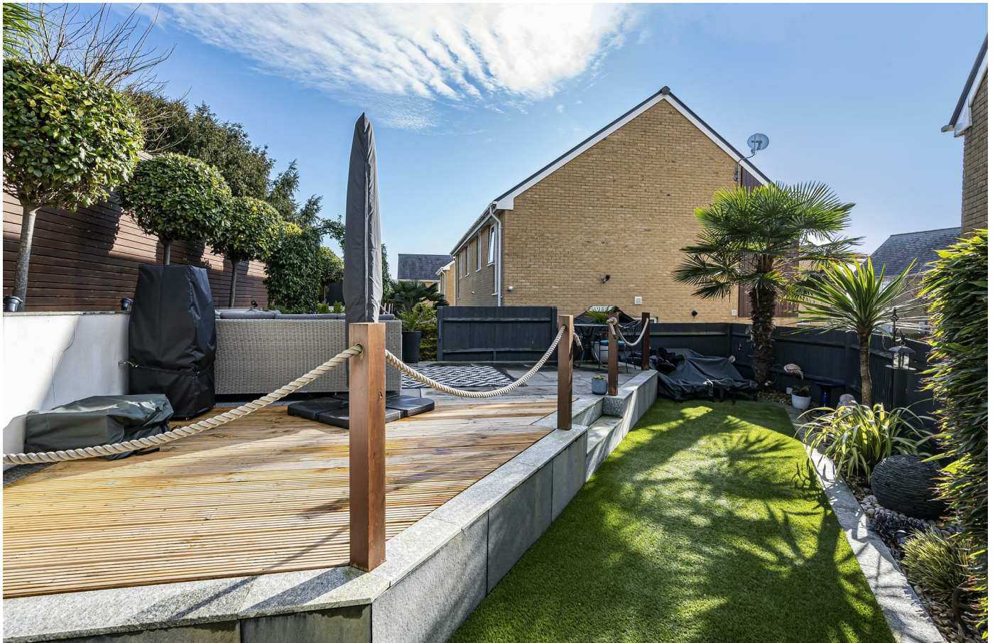
5 Tide Mills View, Newhaven, BN9 0EP