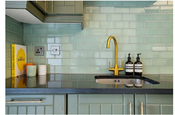
Illustration for identification purposes only, measurements are approximate, not to scale. © CJ Property Marketing Produced for Fine Country