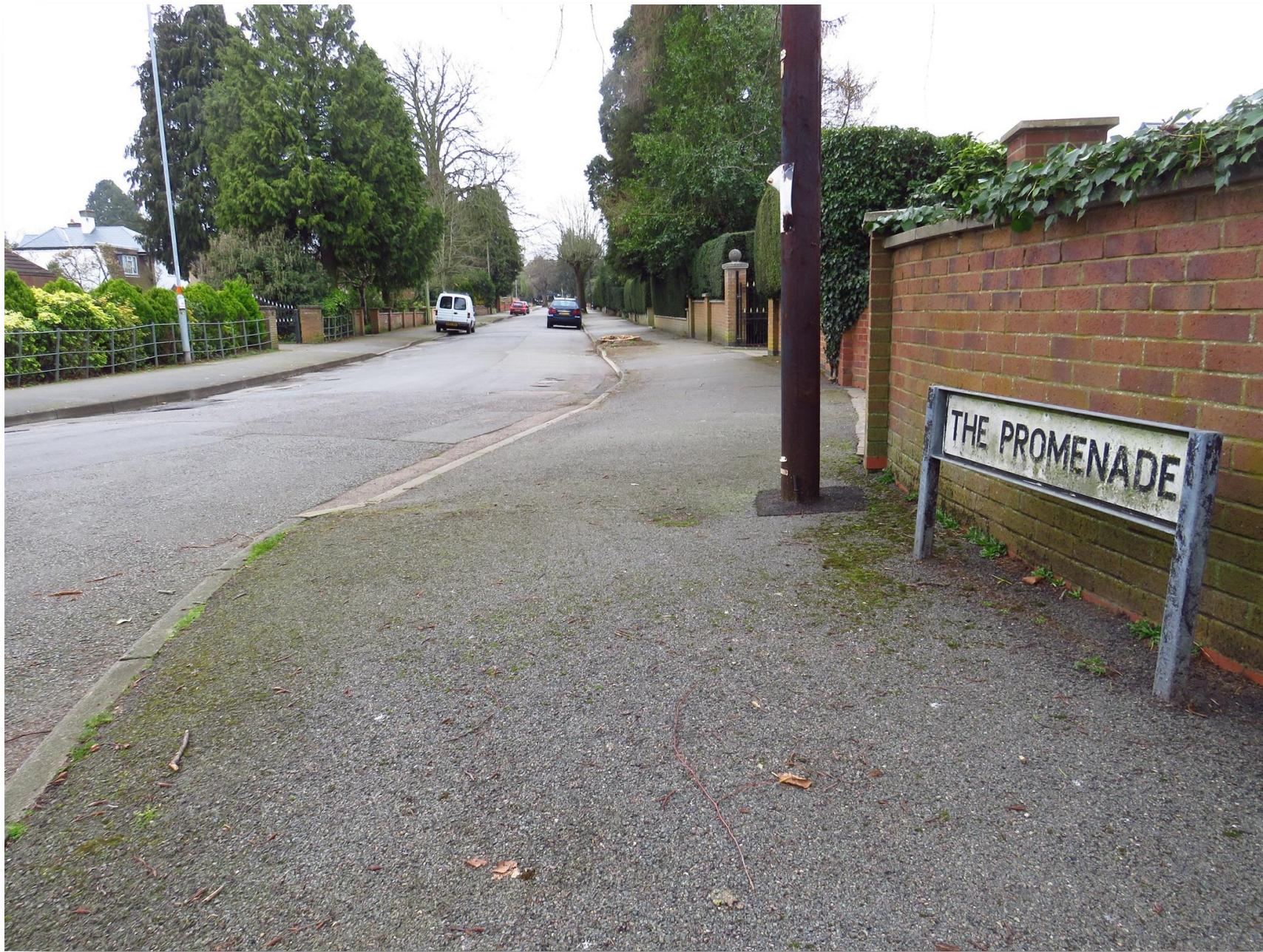
Building Plot The Promenade, Wellingborough NN8 5AL